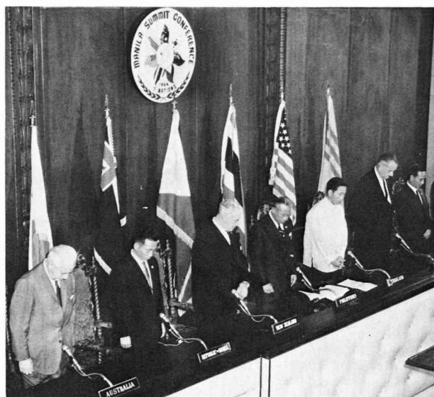
Philippines Free Press