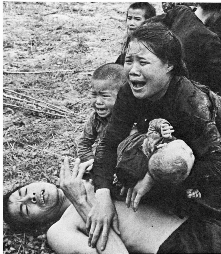
VICTIMS OF WARFARE — In all wars the civilian population suffers horribly. Shown is Vietnamese family grieving over father wounded by artillery shell.

In this light, we can better understand the false reasoning of Adam and Eve when they took of the tree which was a mixture of good (obedience) and evil (disobedience). Their carnal minds REASONED that this mixture of