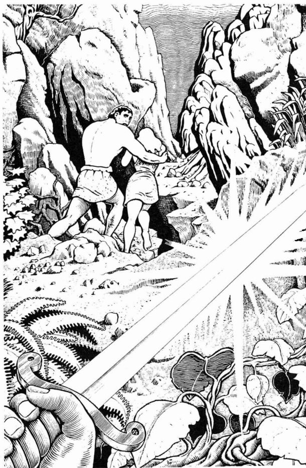
CONSEQUENCES OF SIN — Adam and Eve being driven from Eden and the “tree of life.” They were denied further access to the Holy Spirit because of disobeying their Creator.

3. What was their punishment for disobeying God? Gen. 3:16-19. Were they denied further access to the Holy Spirit? Verses 22-24.